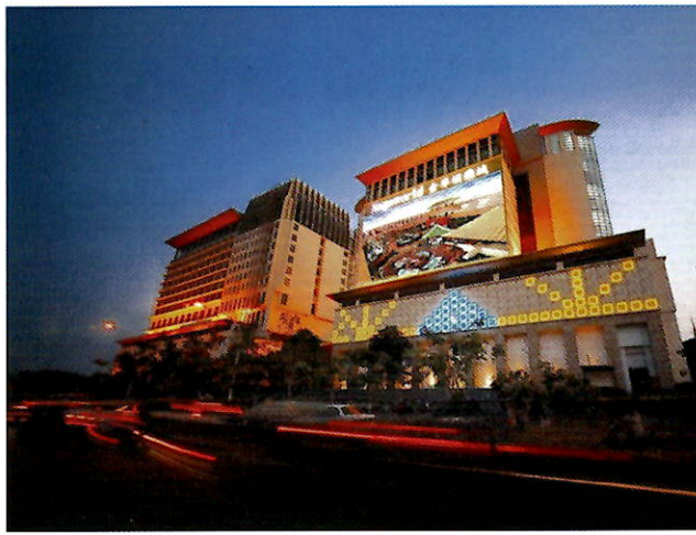
Publicly traded NagaCorp holds a monopoly on gaming in Phnom Penh and has developed two NagaWorld properties (Naga 2 at left), with plans for a third

At the request of the Chinese government, Cambodia agreed to stop issuing new online gaming licenses and let existing licenses expire without renewal. That decision had an immediate and deleterious effect on the gaming industry.