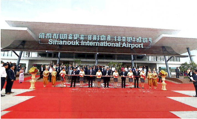
Sihanoukville should rebound from the prohibition of online gaming with an expanded airport and a highway linking the town with Phnom Penh

center of manufacturing, and an important part of the Belt and Road Initiative. It currently contains approximately 90 factories and is master-planned to have up to 300.