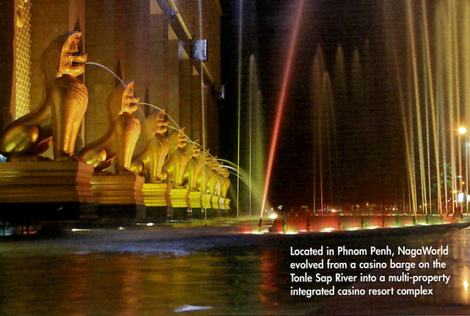
Located in Phnom Penh, NagaWorld evolved from a casino barge on the Tonle Sap River into a multi-property integrated casino resort complex